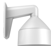
DS-1273ZJ-DM26 Wall mount