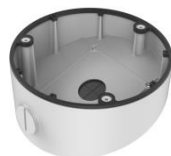
DS-1281ZJ-DM26 Inclined ceiling mount