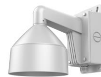
DS-1273ZJ-DM26-B Wall mount with junction box