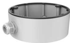
DS-1280ZJ-DM26 Junction box